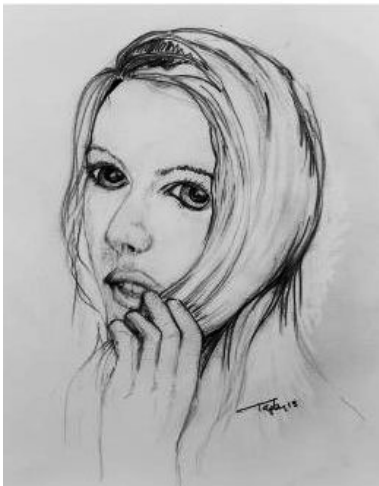
The character, "Spring"

And now this first one shows Barack Obama at the age of 72, and I think my brother has caught a very interesting likeness of him.