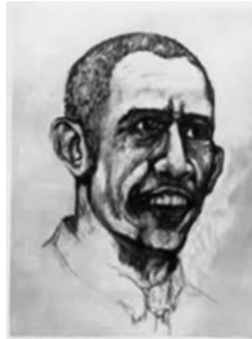
Obama at 72

The reason my brother did a portrait of Barack Obama, aged to 72 years is because the book is about Obama being elected for the seventh time in the year 2032. And another of these very good illustrations of the president in my brother's book is President Obama in his Muslim headdress.